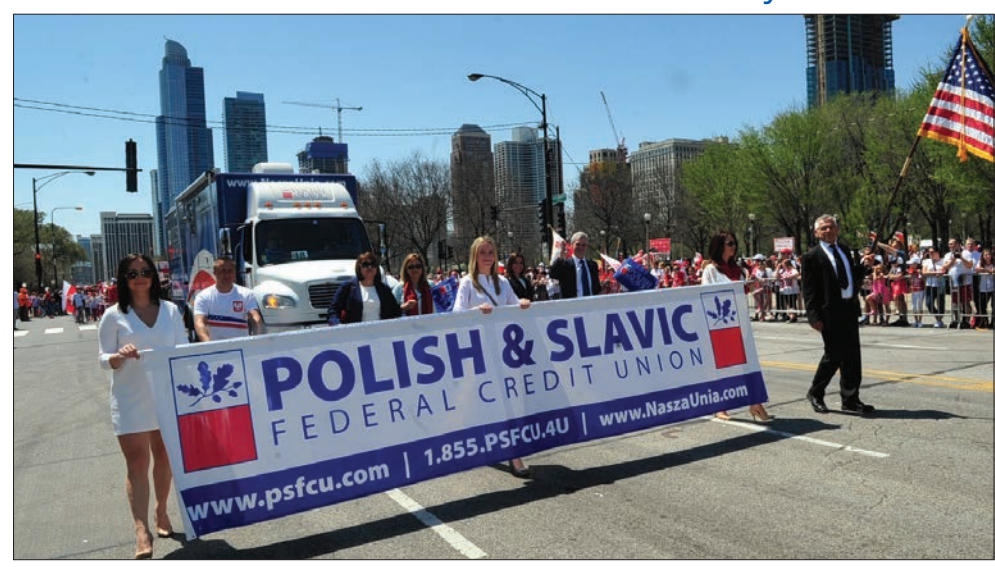
PSFCU representatives at the Constitution Day Parade in Chicago, IL

The 127th edition of May 3rd Constitution Day Parade took place on May 5, 2018, in downtown Chicago. This year the Polish community celebrated the anniversary of the adoption of the May 3 Constitution and the one hundredth anniversary of Poland's regaining independence.