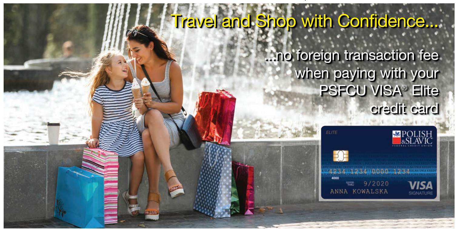
The rate and APR you receive will be based on your credit history and other factors. All loans are subject to credit approval and verification of ability to repay. Applicant must be at least 18 years old. Products and rates are subject to change without notice. Products are not available in all states. PSFCU membership is required. Other restrictions may also apply.

*APR= Annual Percentage Rate. Variable APR is based on the Prime Rate. All loans are subject to credit approval and verification of ability to repay. Other restrictions may also apply.